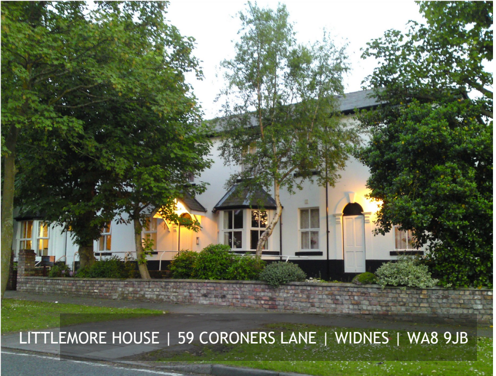
LITTLEMORE HOUSE | 59 CORONERS LANE | WIDNES | WA8 9JB