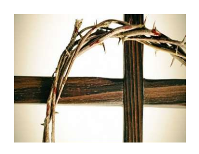
Good Friday The Crucifixion